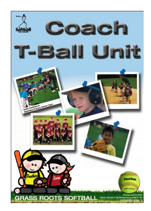
Coach T-Ball Unit

1 Hour practical course for Tee Ball Coaches, Parents or Teachers