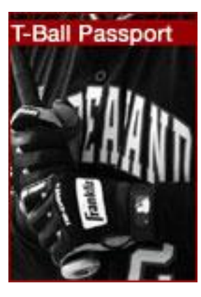
T-Ball Skills Passport Sets

1 Hour practical course for Tee Ball Coaches, Parents or Teachers